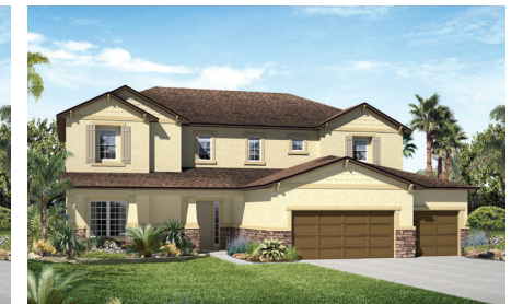
Elevation C - Shown w/Opt stone