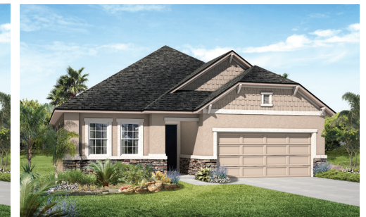
Elevation C - shown with optional stone