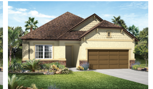
Elevation C - Shown w/ optional stone