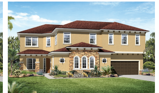
Elevation C - Shown w/ opt. stone