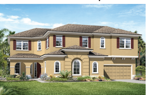
Elevation D Elevation E Elevation J