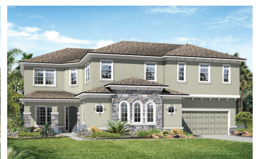
Elevation B Elevation C - shown with optional stone