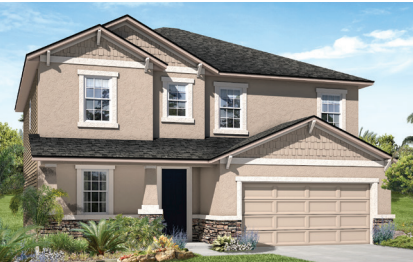
Elevation C Shown w/opt. stone

This plan features an entryway with adjacent living room that can be optioned as a study to suit your needs. At the back of the home, you'll find a great room, a large kitchen with island and a mudroom with walk-in pantry. An upstairs laundry room and loft complete this home.