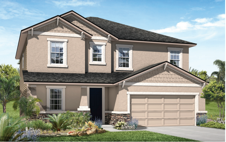
Elevation C Shown with optional stone

Approx. square feet: 2,500 Stories: 2 Bedrooms: 4 - 5 Garage: 2- to 3-car Plan Number: J250