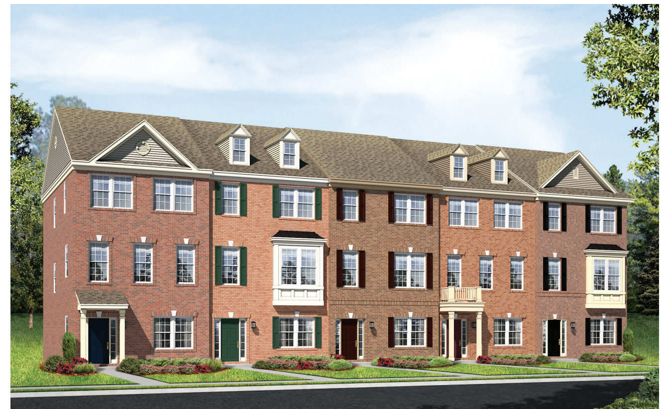
Elevation P, G, L, M, N

COMMUNITY LOCATION 1117 Bayberry Avenue Hanover, MD 21076 888-772-4545