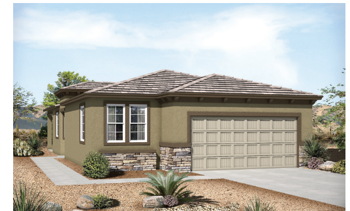
Elevation B - Shown with optional stone