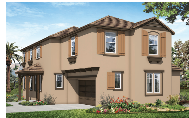
French Country C