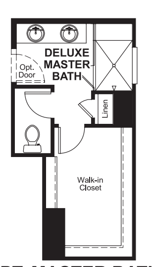
OPT. MASTER BATH W/ TILE SHOWER