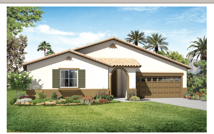
Elevation A - Spanish