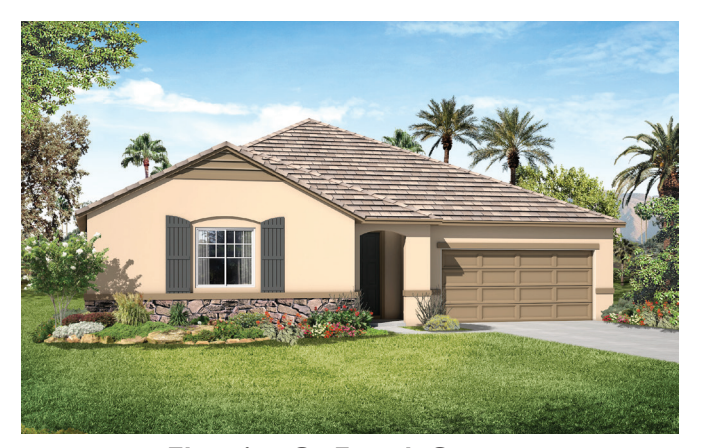
Elevation C - French Country