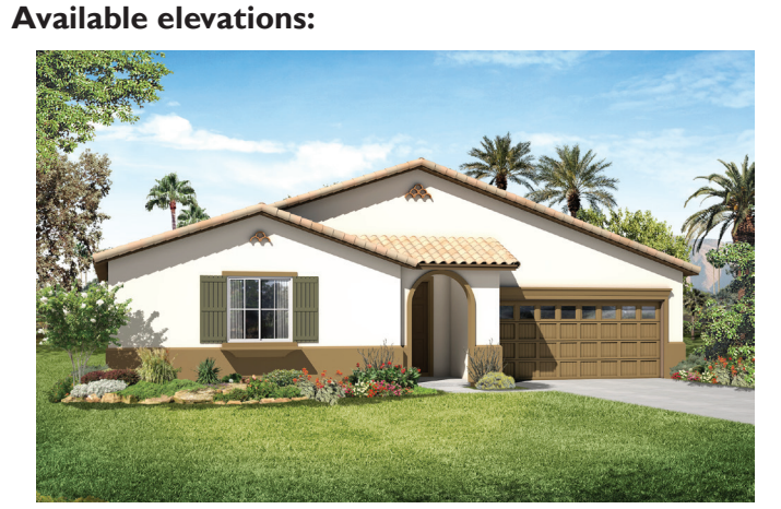
Elevation A - Spanish