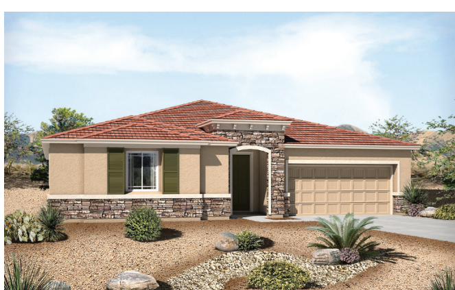
Elevation C - Shown with optional stone