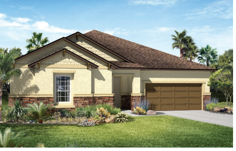
Elevation C - Shown w/ optional stone