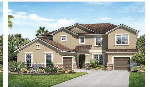
Elevation C - Shown w/ opt. stone