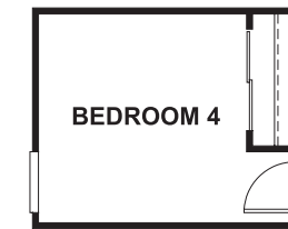
OPT. BEDROOM 4

THIS PLAN'S PROJECTED HERS® INDEX = 68* Projected Rating Based on Plans – Field Confirmation Required