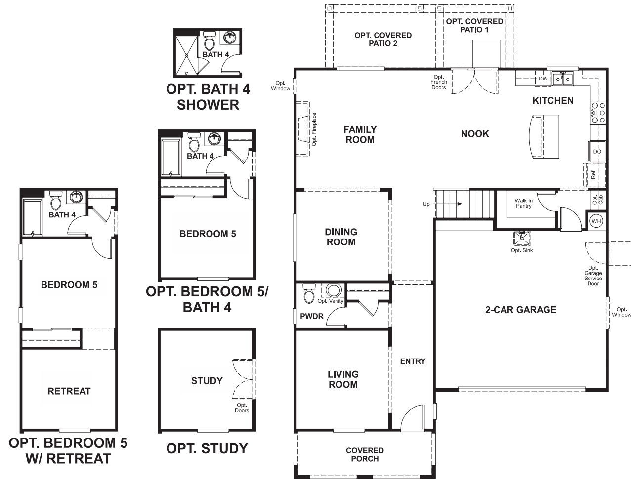
OPT. BEDROOM 5 W/ RETREAT