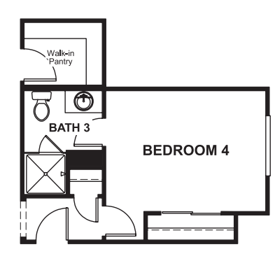
DINING ROOM OPT. BEDROOM 4/BATH 3