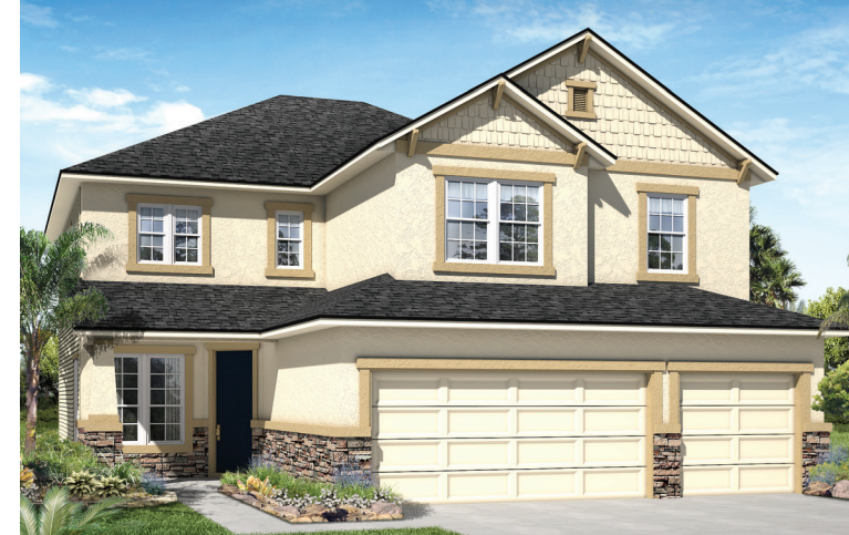
Elevation C Shown with optional stone

Approx. square feet: 2,900 Stories: 2 Bedrooms: 4 - 6 Garage: 3-car Plan Number: J29A