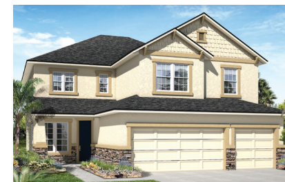
Elevation C Shown w/opt. stone