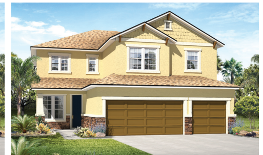
Elevation C Shown with optional stone