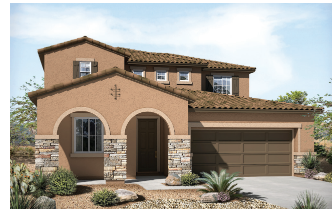
Elevation C - Shown with optional stone