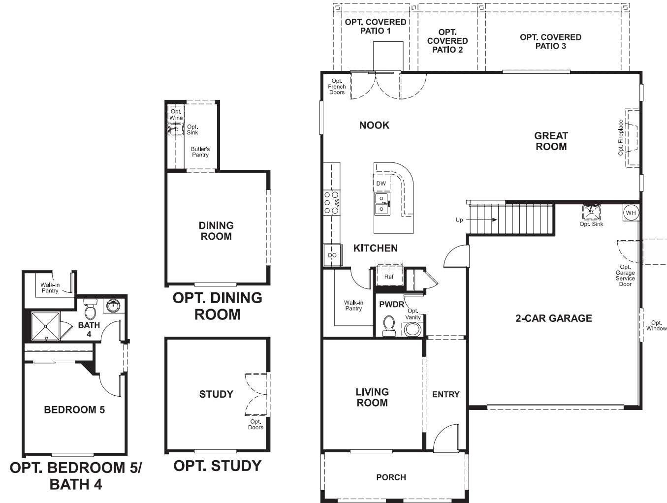
OPT. BEDROOM 5/ BATH 4