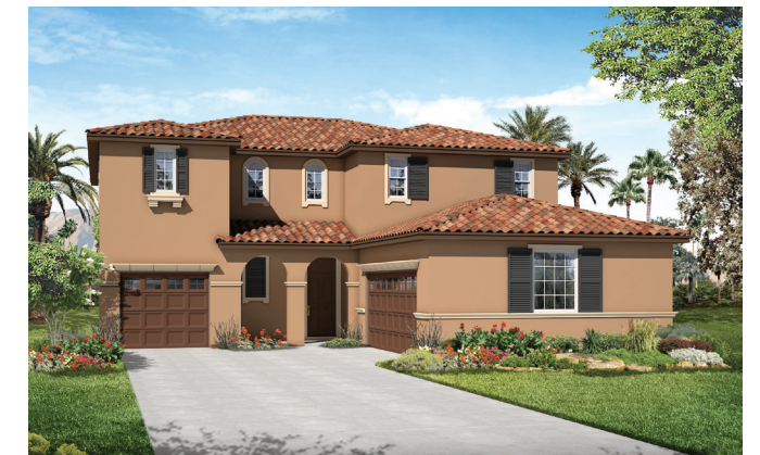
Elevation B - Italian