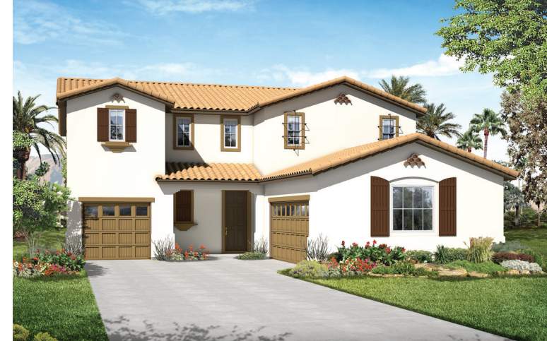
Elevation A - Spanish