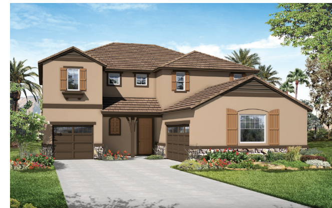
Elevation C - French Country