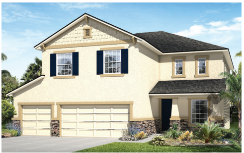
Elevation C - shown with optional stone