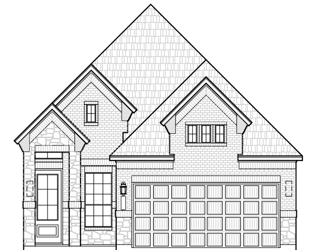
FRONT ELEVATION 'C2'