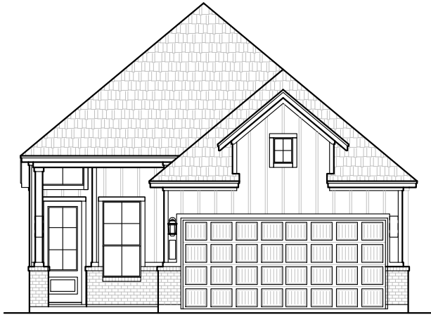
FRONT ELEVATION 'A2'

Plan 169330 | 1693 Square Footage | 3 Bedrooms | 2 Baths | 2-Car Garage