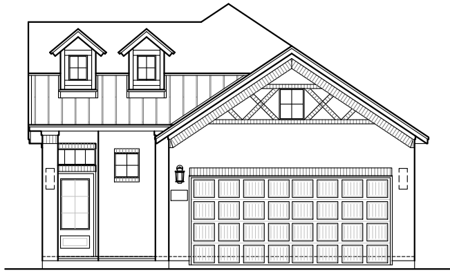
FRONT ELEVATION 'A2'