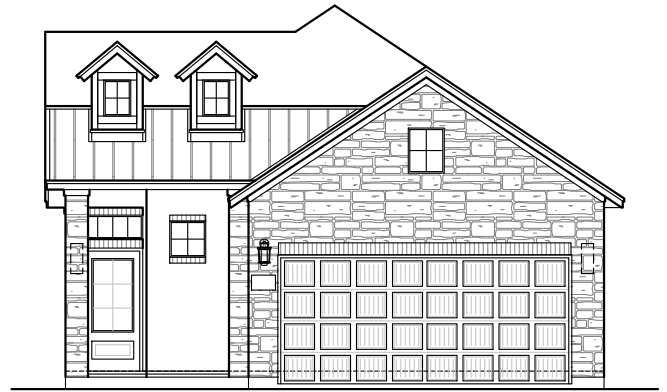
FRONT ELEVATION 'A2' STONE OPTION