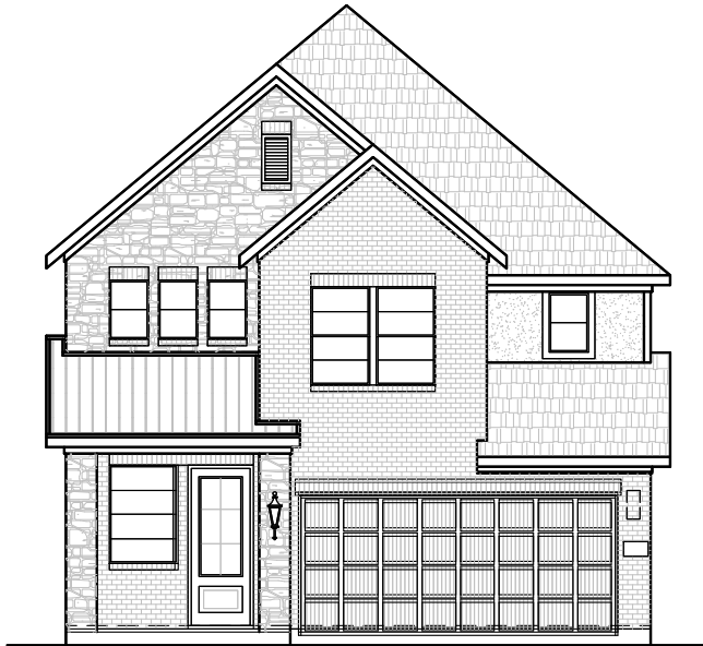
FRONT ELEVATION 'A2' STONE OPTION

Plan 246330 | 2463 Conditioned sq. ft. | 4 Bedrooms | 3.5 Baths | 2-Car Garage