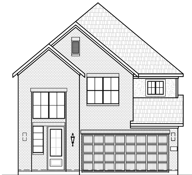
FRONT ELEVATION 'C2'