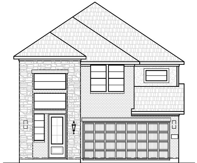
FRONT ELEVATION 'B2' STONE OPTION