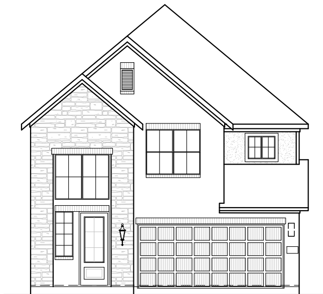
FRONT ELEVATION 'C2' STONE OPTION