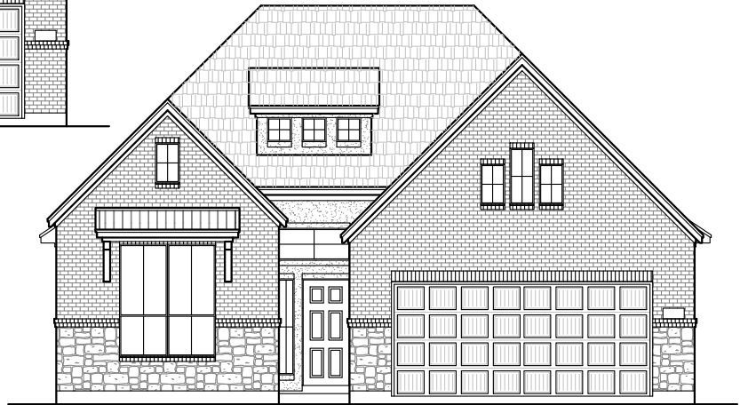
Opt. Elevation A1