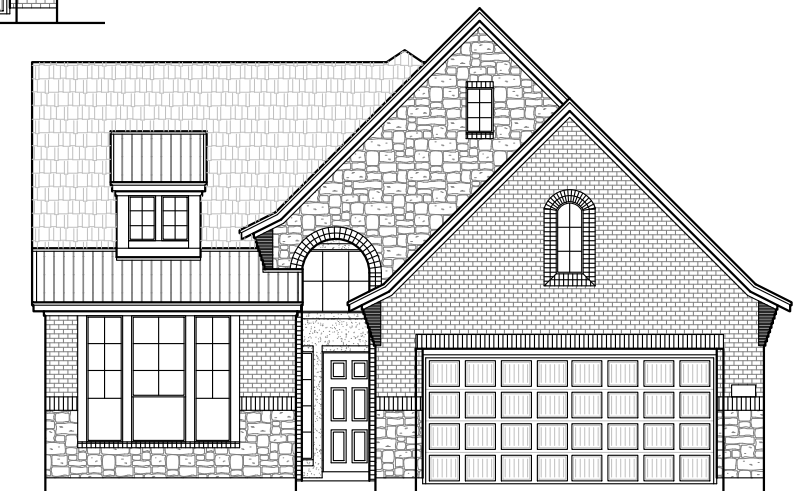
Opt. Elevation B1