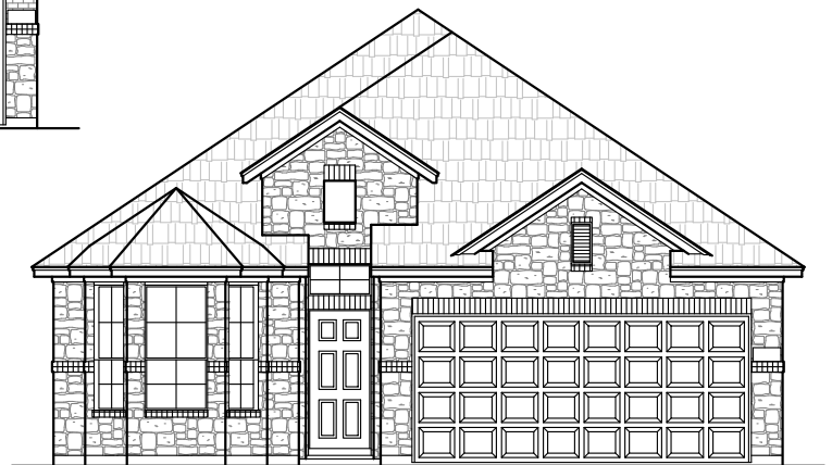
Optional Elevation B2