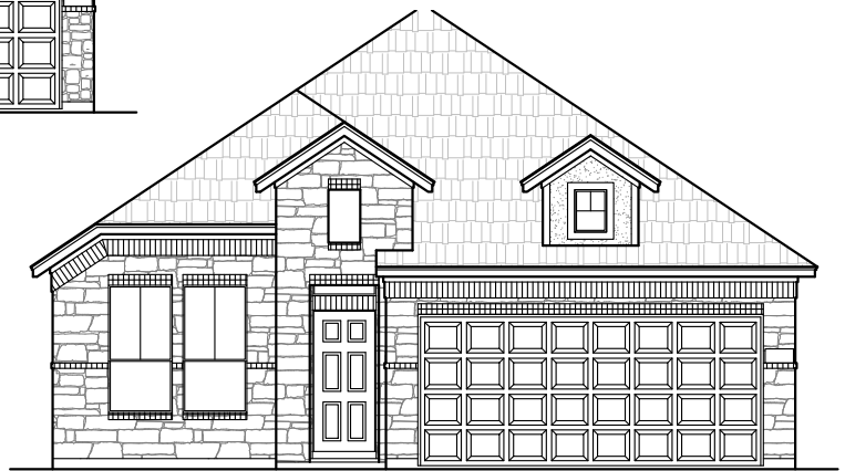
Optional Elevation A2