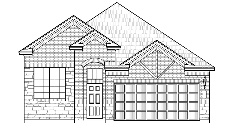
Elevation B: Stone Option