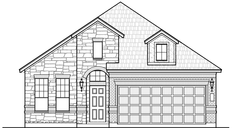
Elevation A: Stone Option