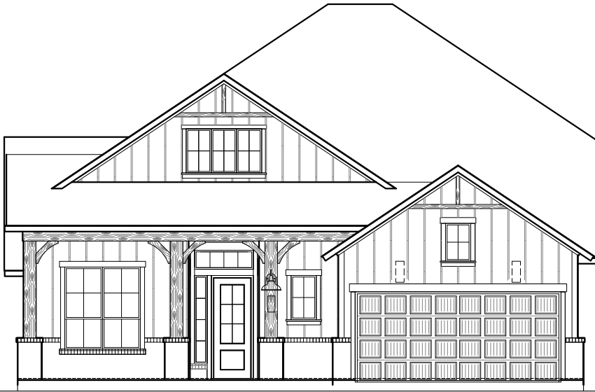
FRONT ELEVATION 'B1'

Plan 286045 | 2860 Square Footage | 4 Bedrooms | 3.5 Baths | 2-Car Garage