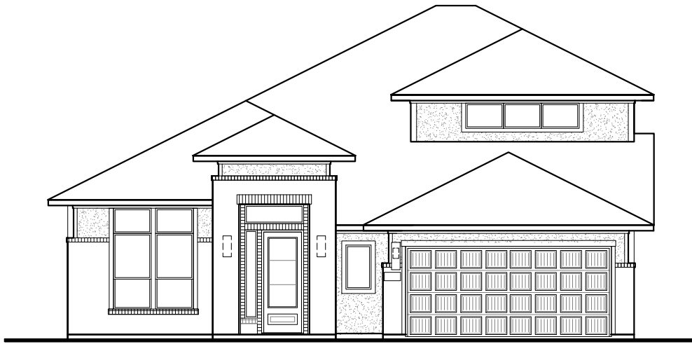
FRONT ELEVATION 'C1'

Plan 286045 | 2860 Square Footage | 4 Bedrooms | 3.5 Baths | 2-Car Garage