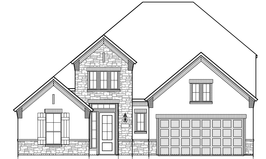
FRONT ELEVATION 'A1' STONE OPTION