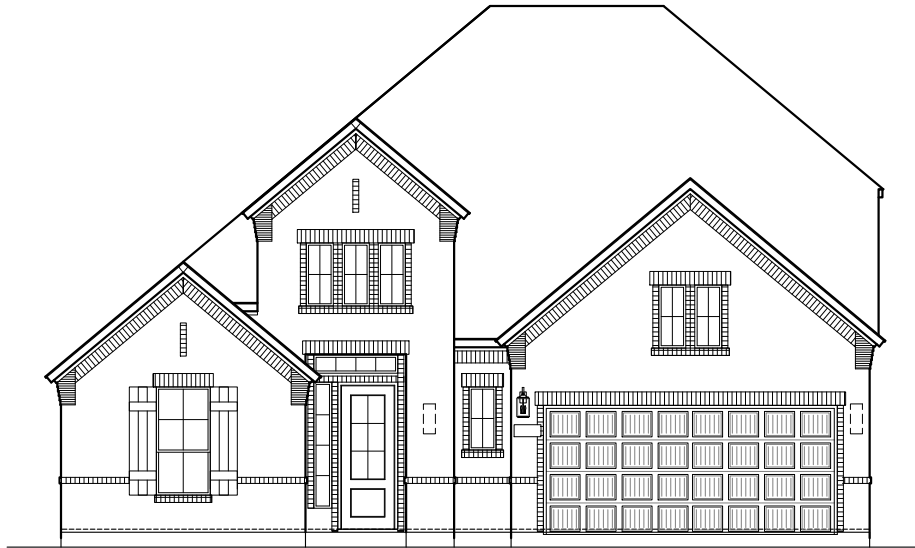
FRONT ELEVATION 'A1'

Plan 286045 | 2860 Square Footage | 4 Bedrooms | 3.5 Baths | 2-Car Garage