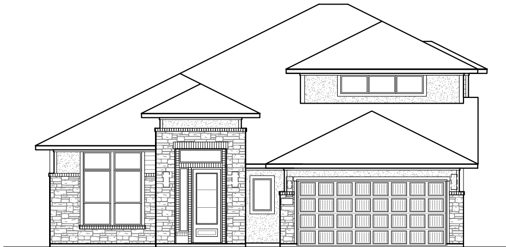
FRONT ELEVATION 'C1' STONE OPTION