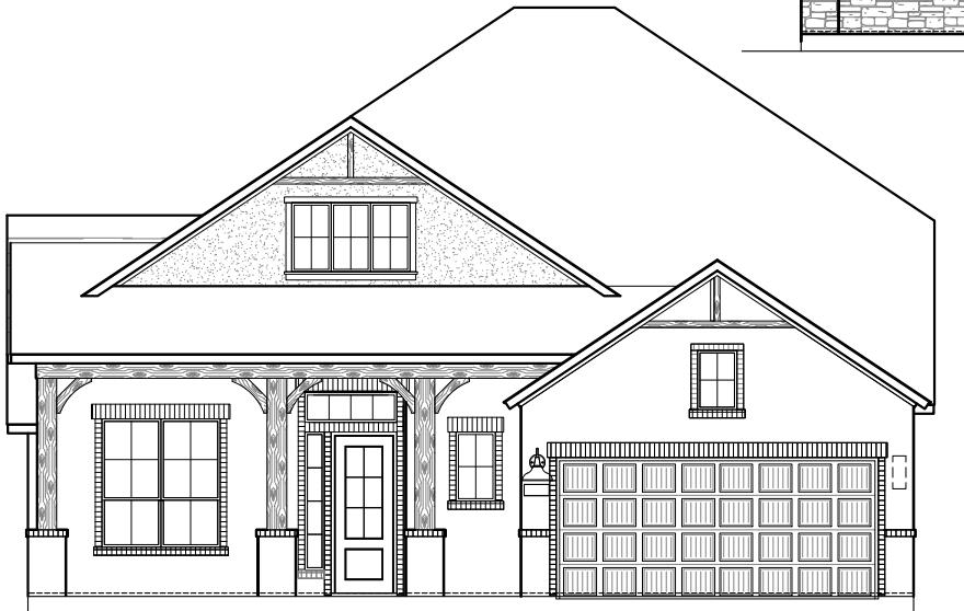
FRONT ELEVATION 'B1' ALL BRICK W/ STUCCO OPTION