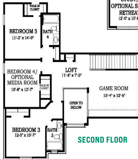
OPTIONAL POCKET OFFICE