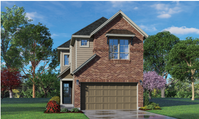
elevation B - brick - standard