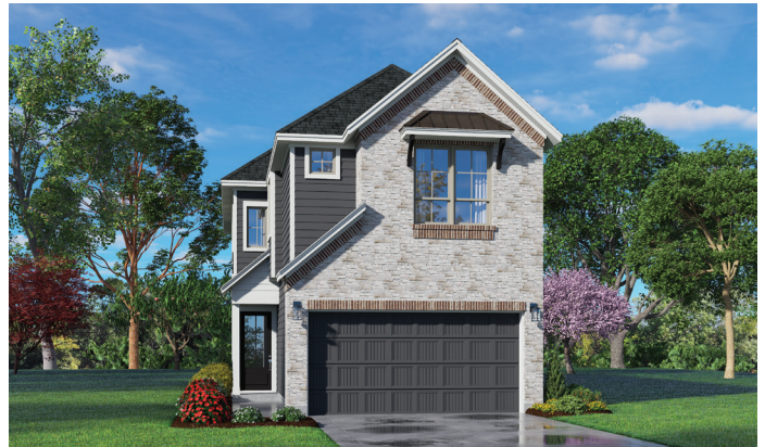
elevation B - stone - optional