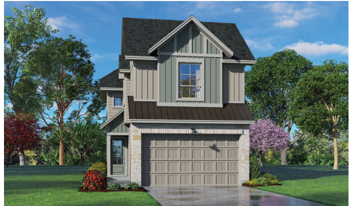
elevation A - stone - optional