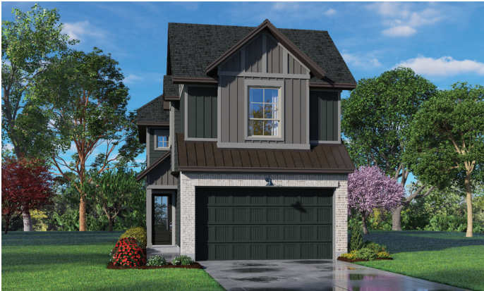
elevation A - brick - standard

CHANTILLY II | plan 7290 - approx. 1,866 sqft