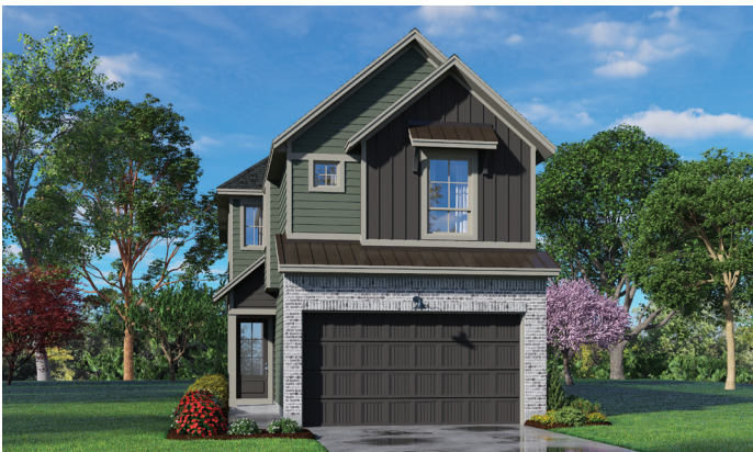
elevation C - brick - standard