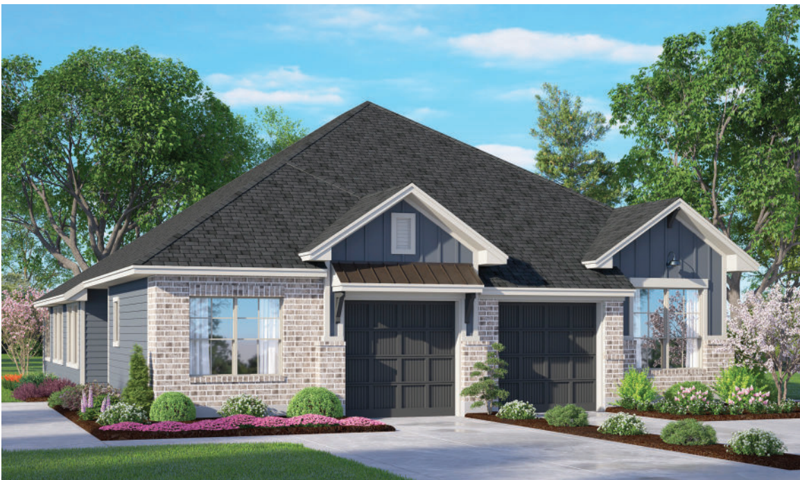
elevation C - Chalet