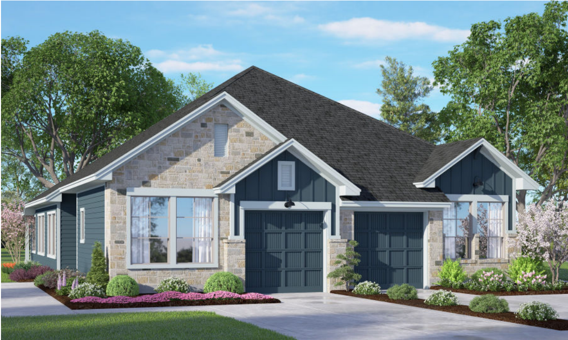
elevation A - Chalet