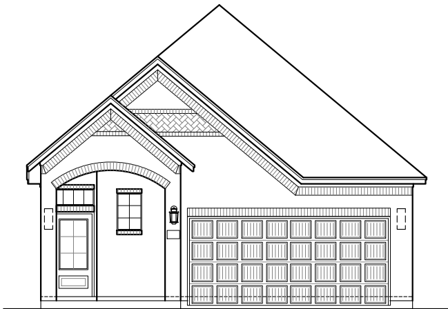
FRONT ELEVATION 'B1'