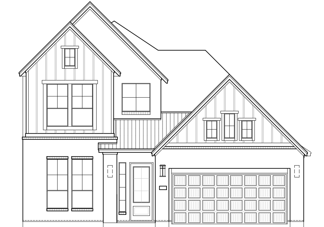
FRONT ELEVATION 'A2'

Plan 270040 | 2700 Square Footage | 4 Bedrooms | 3 Baths | 2-Car Garage