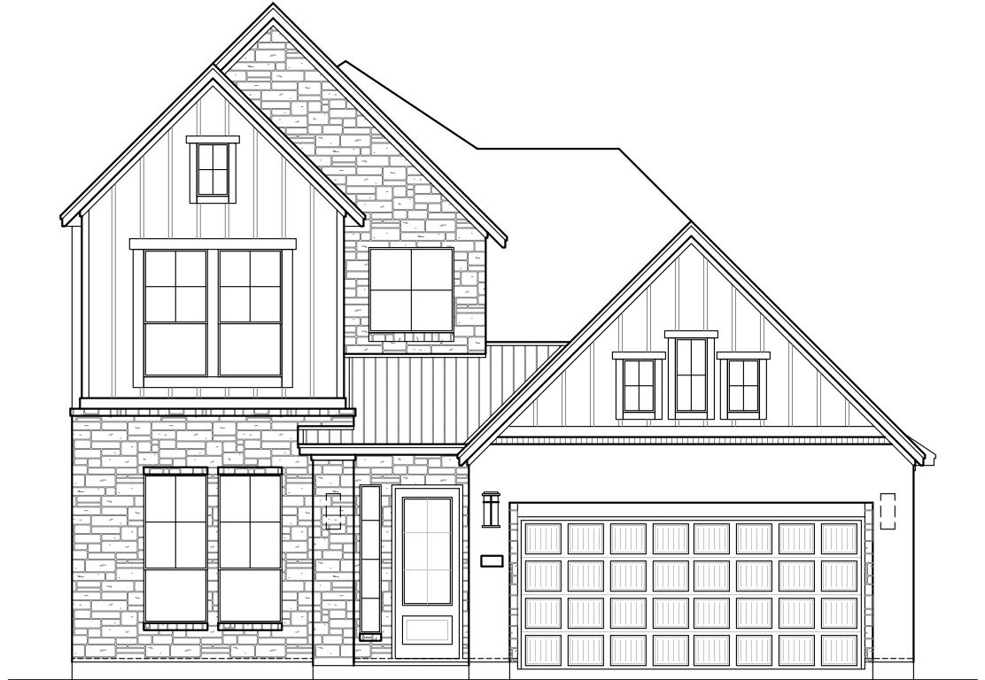
FRONT ELEVATION 'A2' STONE OPTION

Plan 270040 | 2700 Square Footage | 4 Bedrooms | 3 Baths | 2-Car Garage