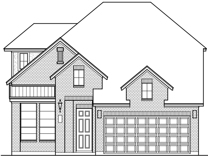
FRONT ELEVATION 'B1'