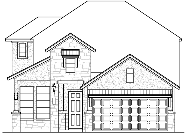
FRONT ELEVATION 'A1' STONE/STUCCO OPTION