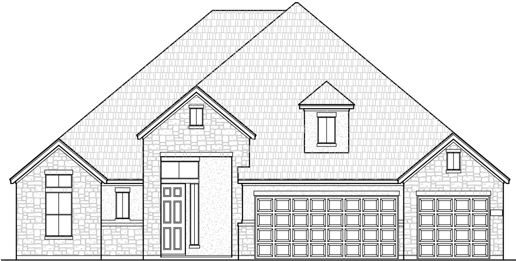
FRONT ELEVATION 'A2' STONE OPTION

Plan 320155 | 3201 Square Footage | 4 Bedrooms | 3 Baths | 2-Car Garage