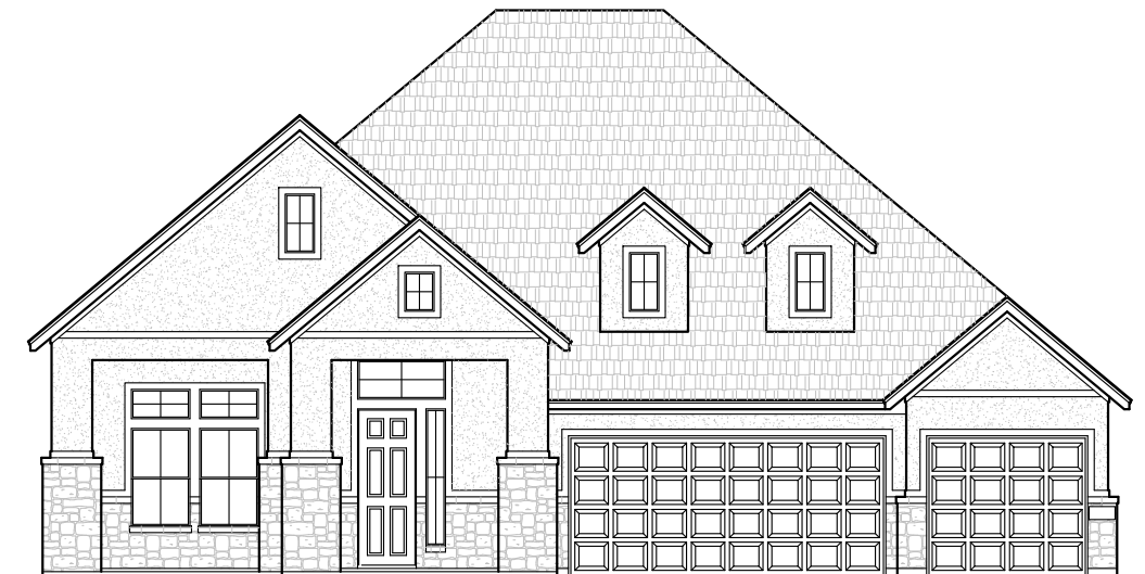
FRONT ELEVATION 'B2' STUCCO OPTION