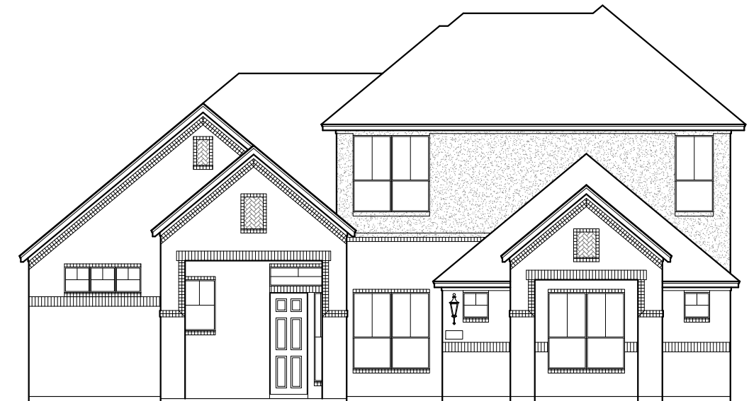
FRONT ELEVATION 'B1'