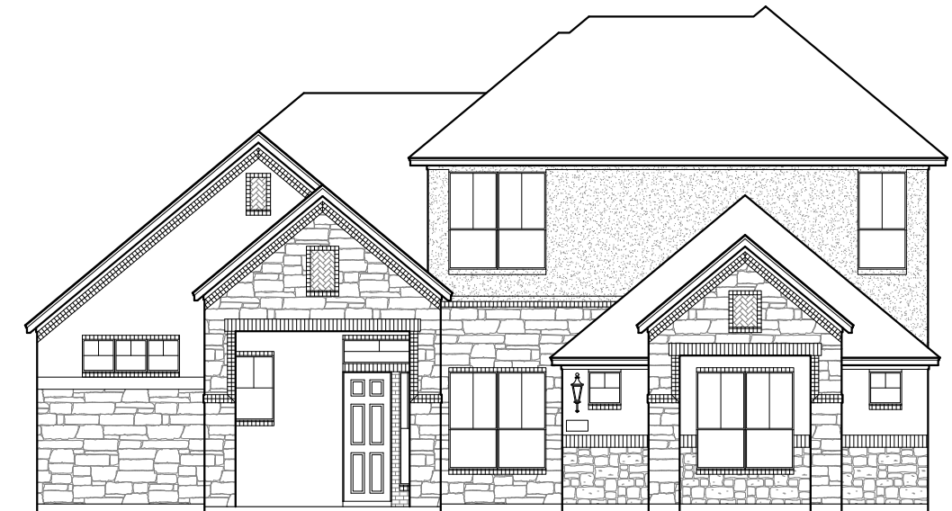
FRONT ELEVATION 'B1' BRICK & STONE OPTION