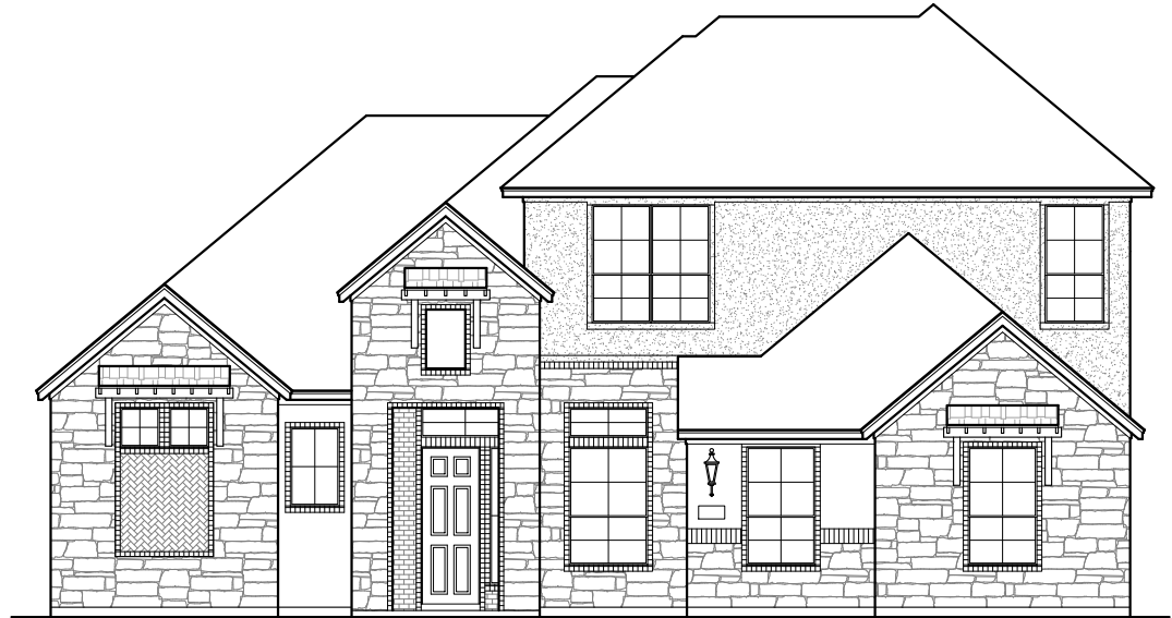
FRONT ELEVATION 'A1' BRICK & STONE OPTION

Plan 331255 | 3312 Square Footage | 4 Bedrooms | 3 Baths | 2-Car Garage