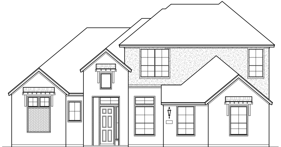
FRONT ELEVATION 'A1'

Plan 331255 | 3312 Square Footage | 4 Bedrooms | 3 Baths | 2-Car Garage