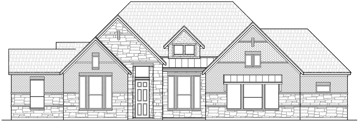
ELEVATION A OPTIONAL STONE

Plan 2632 | 2,632 Conditioned sq. ft. | 4 Bedrooms | 3.5 Baths | 2-Car Garage w/ Storage