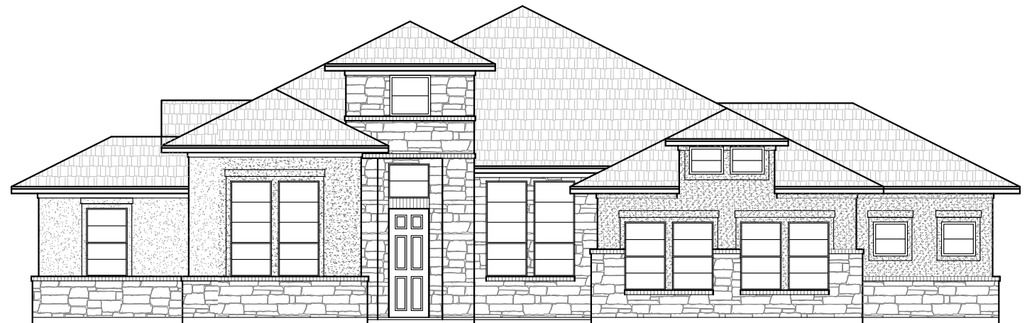
ELEVATION C OPTIONAL STONE