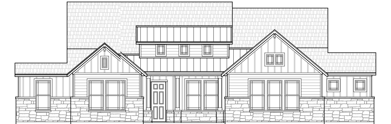
ELEVATION B OPTIONAL STONE