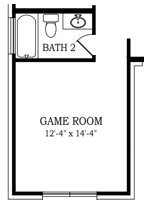
OPT. GAME ROOM AT BEDROOM 4