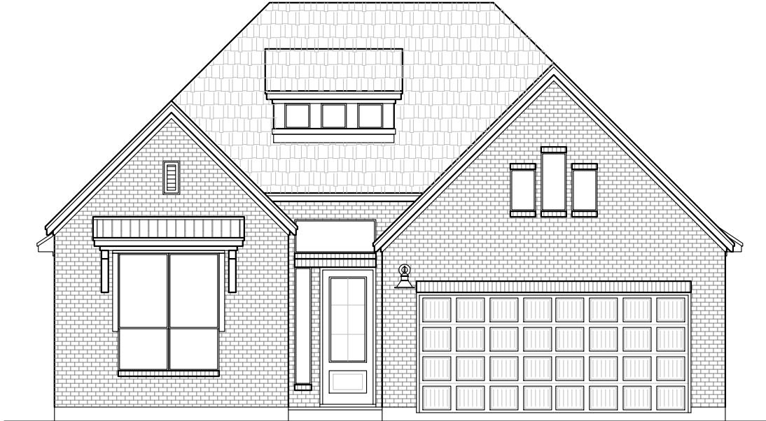
Elevation A2 Full Brick Opt.

Plan 239940 | 2399 Square Footage | 4 Bedrooms | 3 Baths | 2-Car Garage