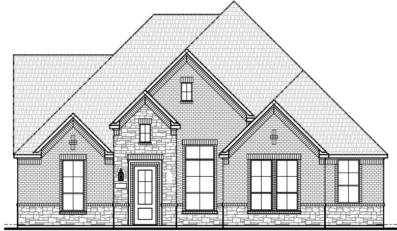
FRONT ELEVATION A STONE OPTION