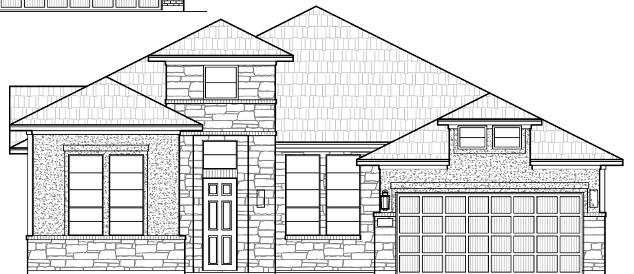
ELEVATION C OPT. STONE