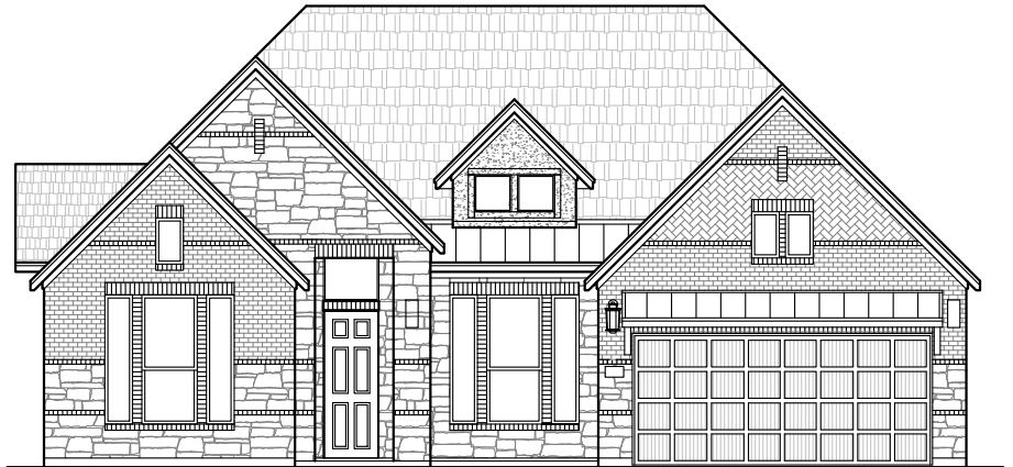
ELEVATION A OPT. STONE