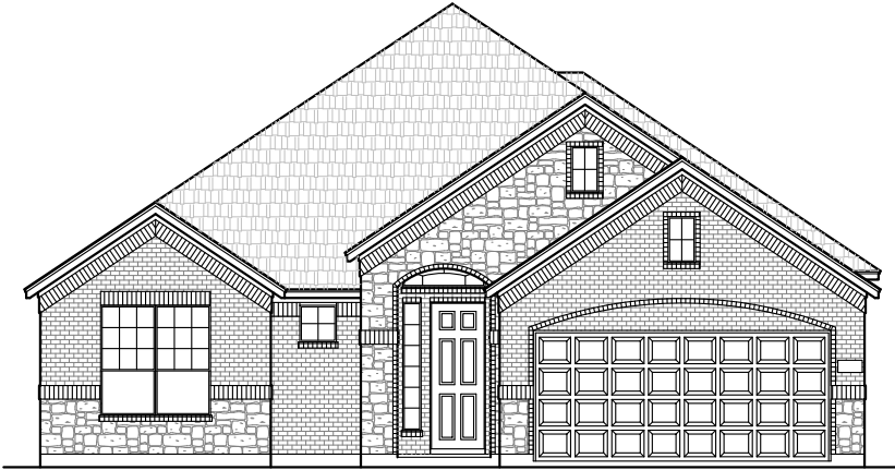
Optional Elevation A1

Plan 2086 • Parker • 2,086 Conditioned sq. ft.