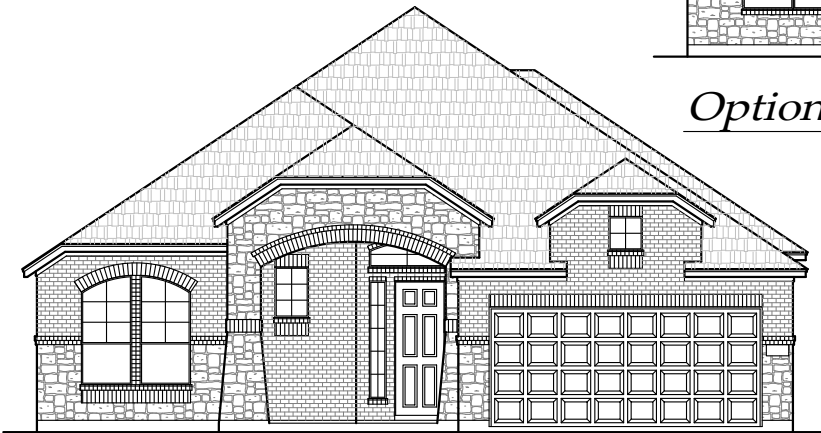
Optional Elevation B1