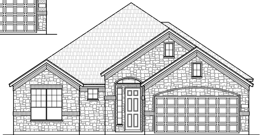
Optional Elevation A2