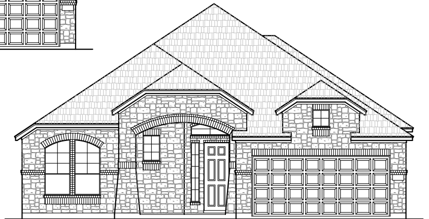
Optional Elevation B2