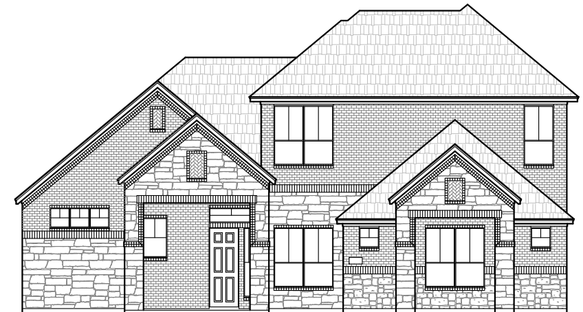
Opt. Elevation B1