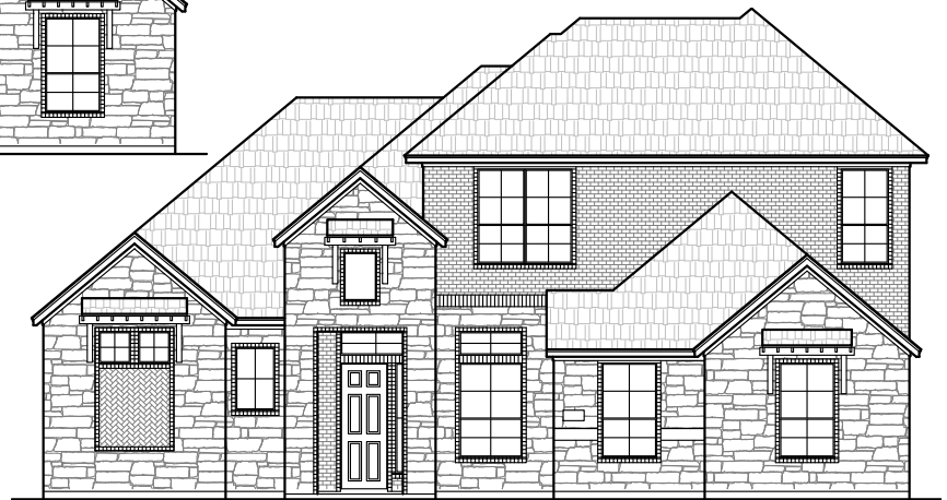
Opt. Elevation A2