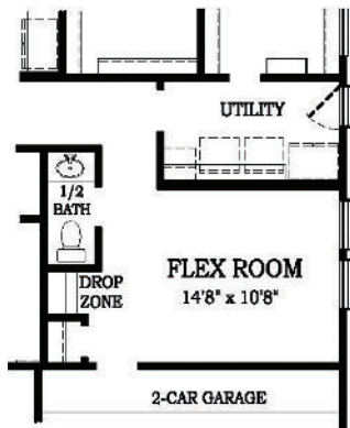
OPTIONAL FLEX ROOM AT GARAGE STORAGE