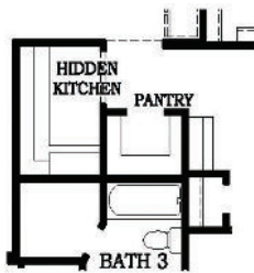
OPTIONAL HIDDEN KITCHEN