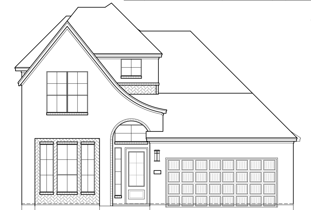
FRONT ELEVATION 'B1'