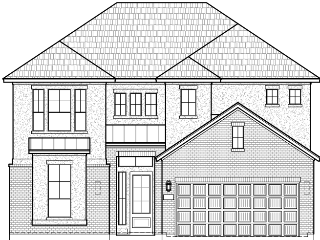
FRONT ELEVATION A2

Plan 306540 | 3065 Square Footage | 5 Bedrooms | 4 Baths | 2-Car Garage