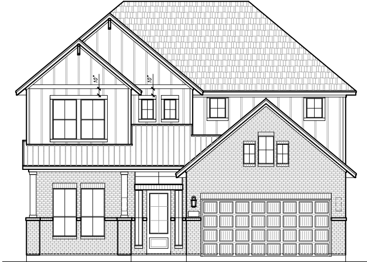
FRONT ELEVATION C2

Plan 306540 | 3065 Square Footage | 5 Bedrooms | 4 Baths | 2-Car Garage