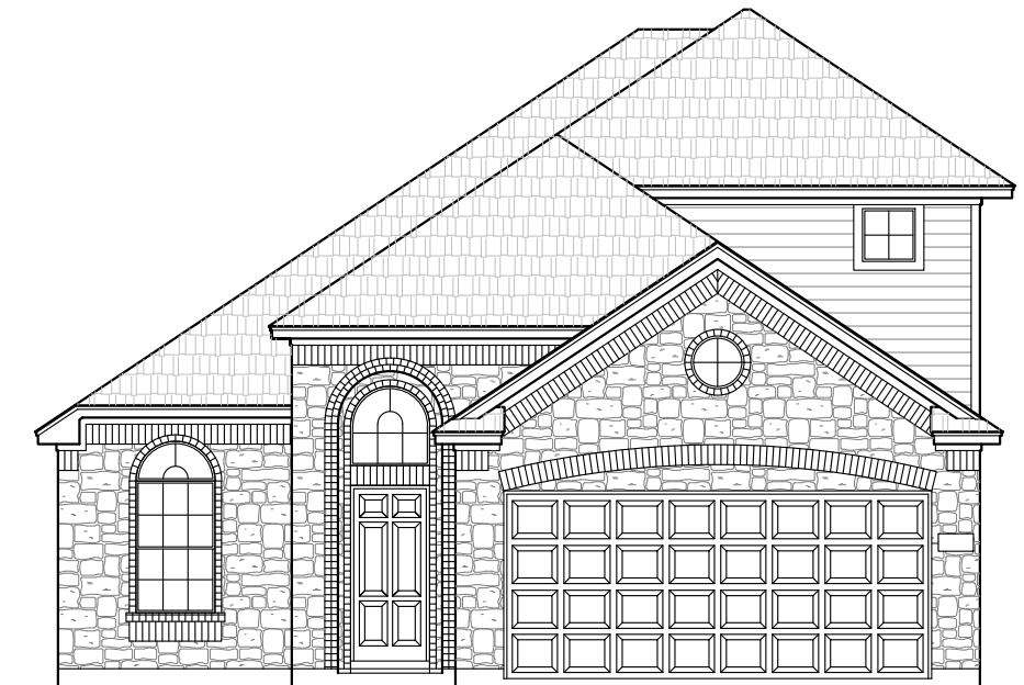
Opt. Elevation A2