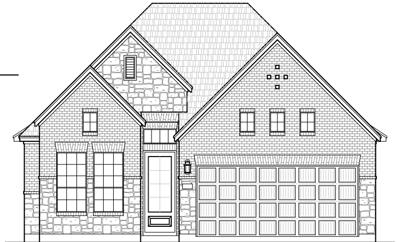
OPT. ELEVATION A w/STONE