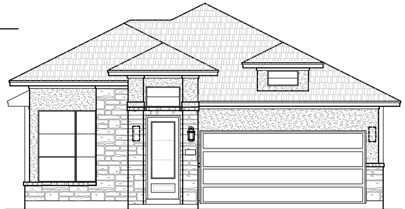
OPT. ELEVATION B w/STONE