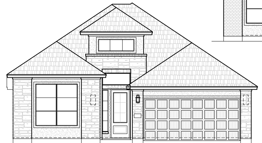
Elevation C STONE OPTION