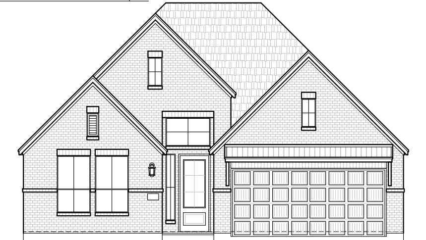
Elevation A FULL BRICK OPTION