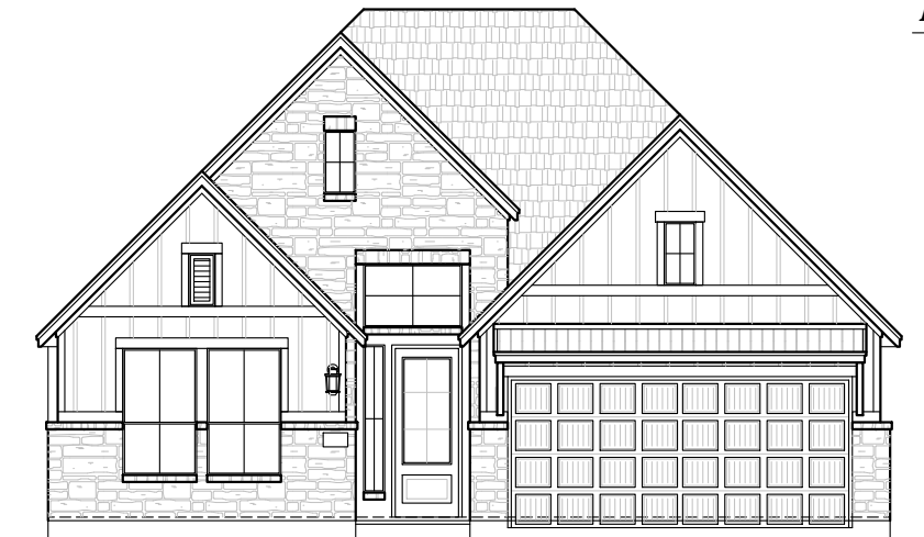
Elevation A STONE OPTION